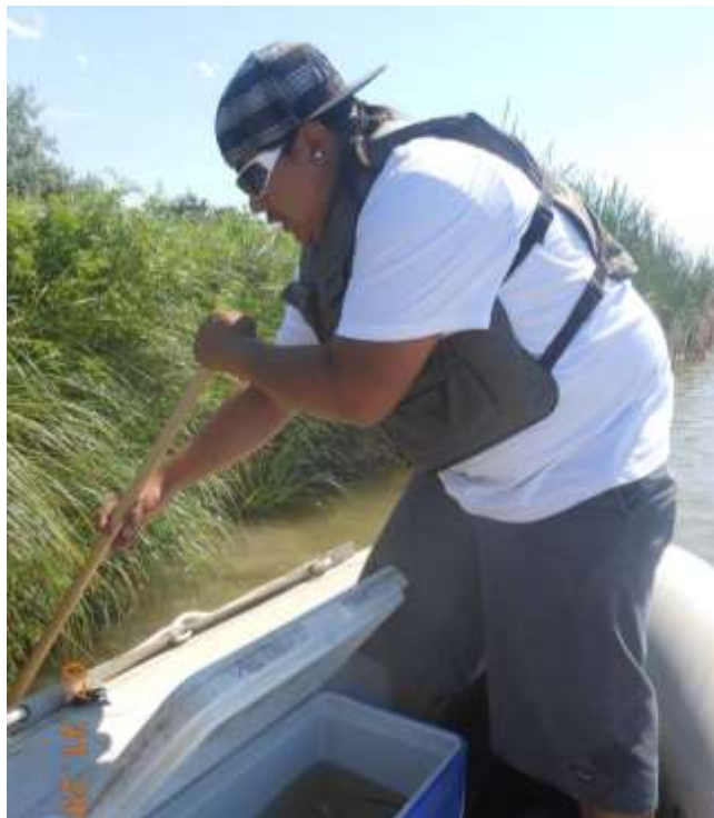
Environmental Science Student collecting water samples.

Students are ultimately responsible for their own valuables. Aaniiih Nakoda College is not responsible for personal injuries or property damage.