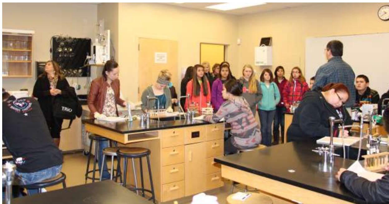
Aaniiih Nakoda College Biology Class with junior high school visitors.

01-05 credits - Part-Time Status 06-08 credits – ½ Time Status 09-11 credits – ¾ Time Status 12-18+credits - Full-time Status 19+ credits - (requires Dean of Academic Affairs' approval)