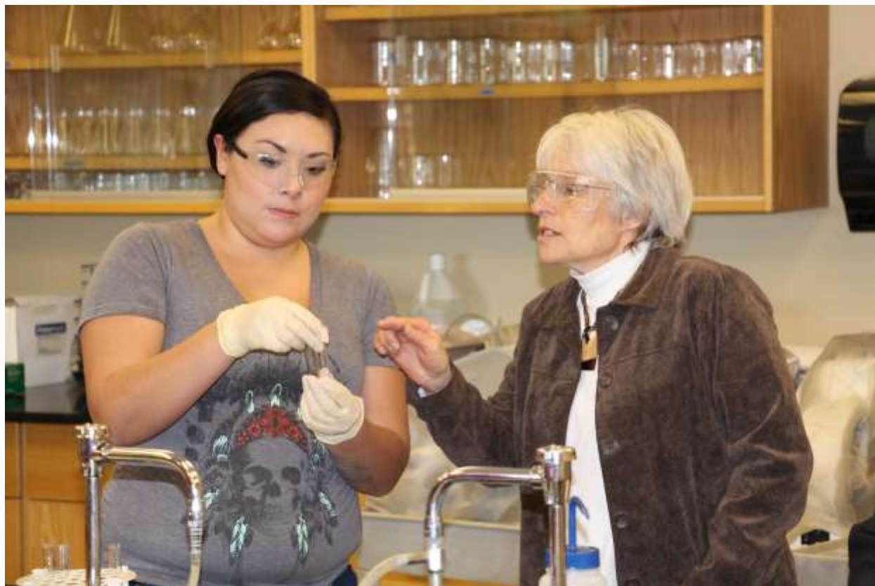
Aaniih Nakoda College chemistry class.

The Native American Career and Technical Education Program (NACTEP) is a Department of Education funded project designed to meet the vocational and technical education needs of the Fort Belknap Indian Reservation. The project provides education, training and work experience in the fields of Natural Resources, Nursing, Carpentry, Tribal Management and Computer Technology for at least 45 students each year.