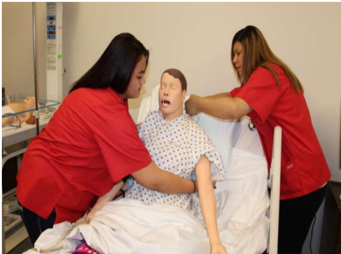
SIMS Lab – C.N.A. Students

Aaniiih Nakoda College reserves the right to change or withdraw courses, to change the fees, rules and calendar for admission, registration, instruction, and graduation and to change other regulations affecting the student body, at any time when necessary.