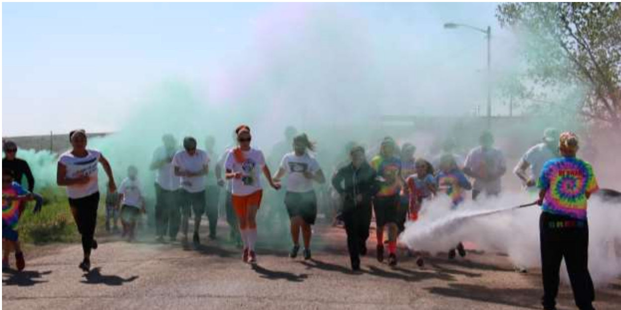
Color Me Fun Run

victims of medical or traumatic emergencies; stabilizing their condition; transporting them safely and expeditiously to an appropriate facility; providing exceptional care with the safety of yourself, your colleagues and the general public being of the utmost importance. This course aims to promote confidence, develop intelligence and situational practicality, qualities that are essential to the EMT-B. Upon successful completion of the course, including internship hours, students may be endorsed to sit for the NREMT (National Registry of Emergency Medical Technicians) exam.