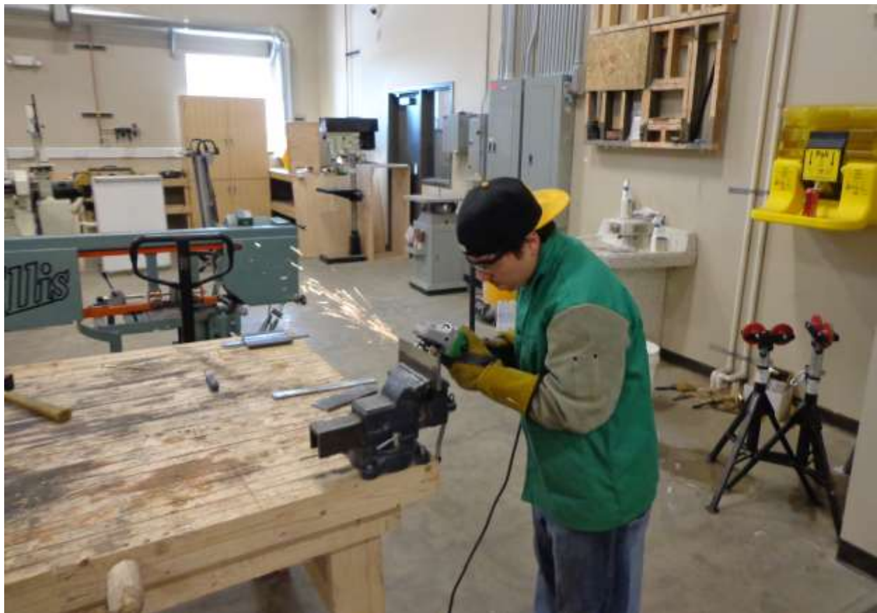
Aaniih Nakoda College Carpentry Program

Special topic courses are offered on demand as an elective for all of the degree programs.